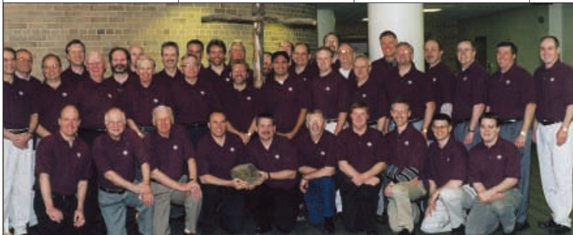
The Joshua Men from Zion Lutheran Church gather around the oak cross and the stone baptismal font used at the covenant service