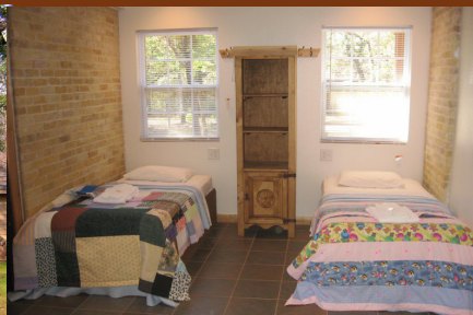
Oak Grove cabin