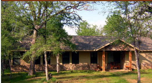
Oak Grove cabin