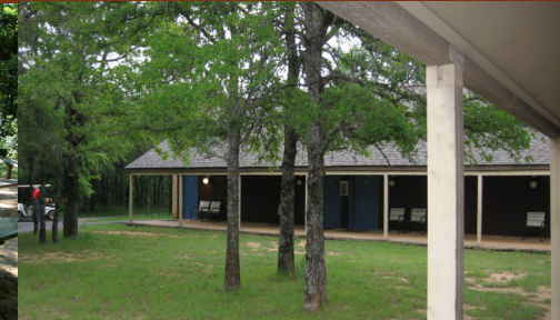
Quail Run Motel Style Rooms