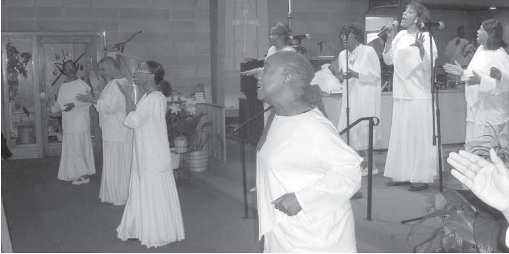
Many glorify God through Good Shepherd's dance and music ministries.