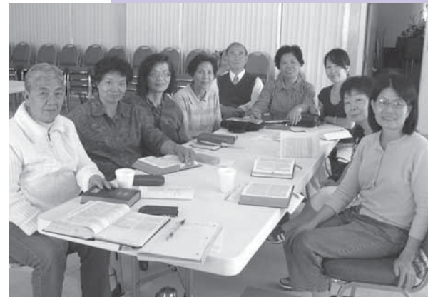
Glory Lutheran Church emphasizes discipleship training for all participants.

"I encourage members to invite and reach out to others," she says. "Church is not just a get-together for our members. To spread the gospel to your neighbor, you need to invite people every week." ●