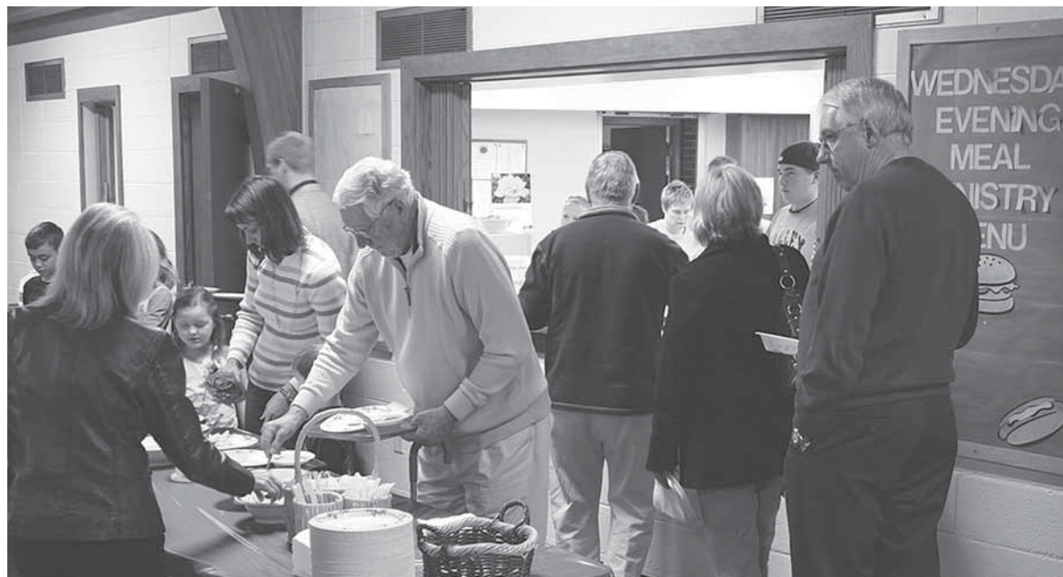
Eikon, the St. Mark high school group, serves a Lenten soup supper.

G rowing congregations profiled in this newsletter have no members. They have disciples instead.