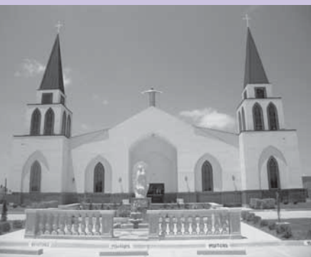
Santa Maria de Guadalupe was designed to look like a church in Latin America where the main entrance to the sanctuary is obvious.

Our Mission The ELCA Mission Partners program establishes reciprocal relationships between congregations of the ELCA so that all partners might become strong centers for mission. These connections include various types of support and may occur within the same synod or across synod boundaries.