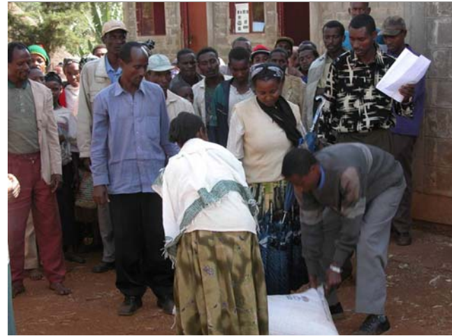
This relief ration not only keeps people alive, it keeps them from selling all of their assets (such as cattle), and it keeps them from becoming refugees.