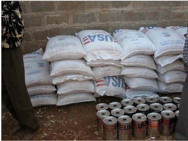
Three bags of wheat are divided among 10 people.