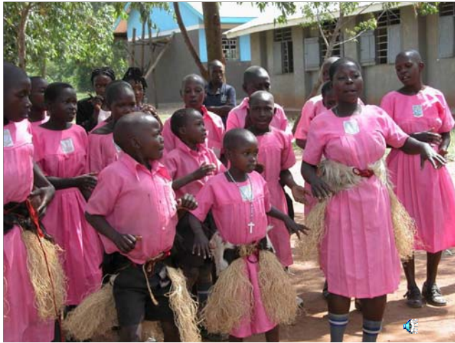
Some of the school children sang a thank-you song to AMREF. Listen for the powerful line in the refrain, “education is life insurance.”