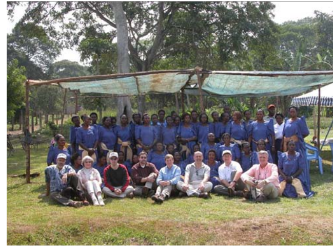
The Katosi Women Fishing and Development Association used the grants and technical assistance it received from Lutheran World Relief as a transformational stepping stone, improving the lives of its 48 members, their families, and the Katosi community. Your gifts to the ELCA World Hunger Appeal and Stand With Africa, through LWR, made a visible difference here. Katosi Women Fishing and Development Association has graduated from receiving grant money from LWR, but it will continue to be in relationship with LWR staff, receiving technical assistance as needed.