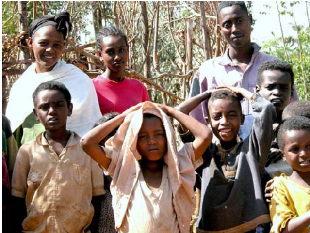
These last photos are taken as we leave the relief station.