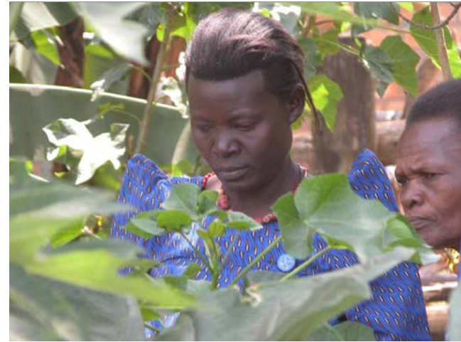
Moving on in Uganda, we are blessed to visit the Katosi Women Fishing and Development Association.