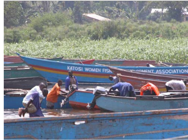
It started when a small group of women, many widowed, entered the man's world of fishing on Lake Victoria. With grant help from Lutheran World Relief, the women purchased four boats, including one refrigerated boat, hired fishermen, and set up business.