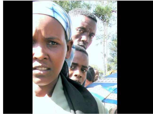
Your gifts to the ELCA World Hunger Appeal and Stand With Africa make a life-saving difference.