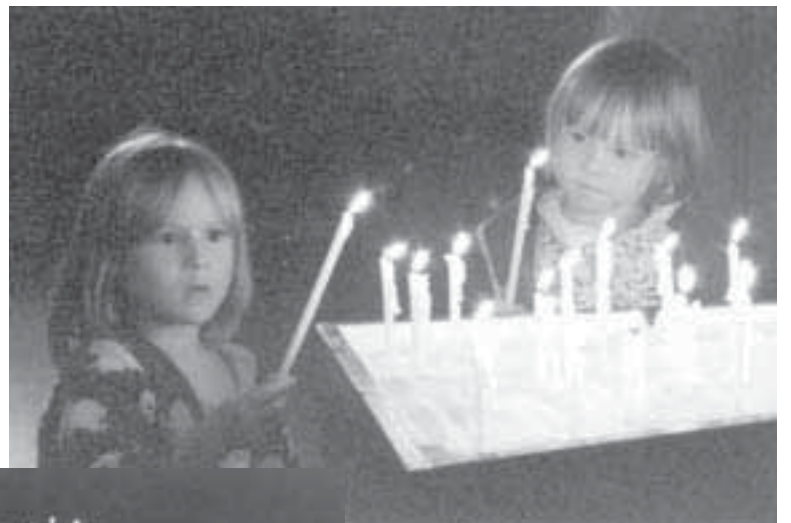
Two young participants in Pilgrim Lutheran's Celtic worship service light candles in the shape of a cross.

The Celtic service, as well as our global services, grew out of our congregational approach to worship, which is to deepen classic liturgical traditions, while widening the range of our worship styles. Our worship conference, which took place in