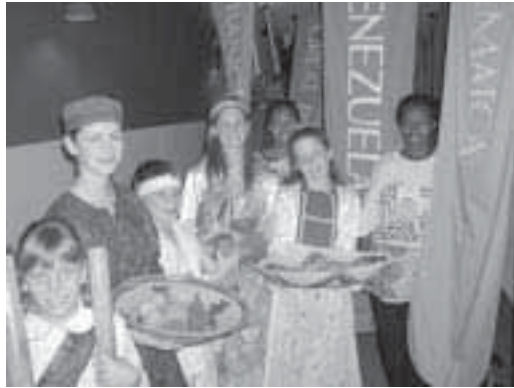
Global Mission Events are multigenerational and multinational, and invite people of all ages to participate in God's global mission.

As always, a lively mix of worship, music, art, workshops, food and fellowship will bring to life God's mission around the