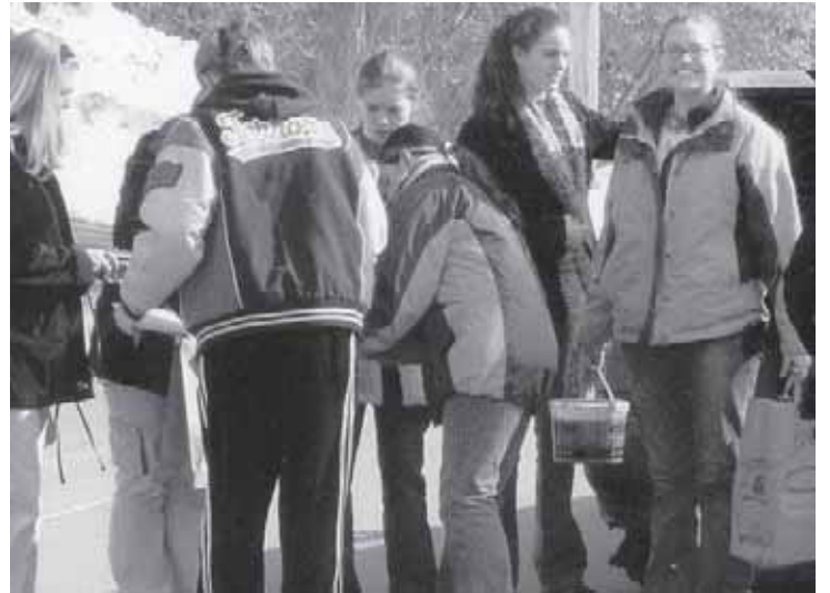
Youth from Zion Lutheran, Appleton, Wis., deliver chili to shelters.

There are wonderful ideas for "souping up" your Souper Bowl collection: asking for donations equivalent to what