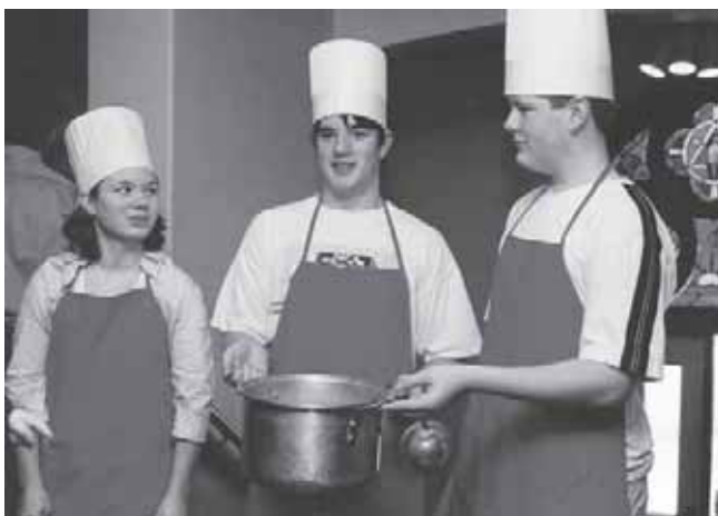
Youth from First Lutheran, Manitowoc, Wis., wear their chefs' hats and bang on pots to promote the Souper Bowl.

Add the joy of giving and serving to the fun of the Super Bowl game. The goal for 2005 is to raise $5 million for designated hunger charities, and to mobilize 20,000 young people in a service blitz on Service Blitz Saturday (February 5).