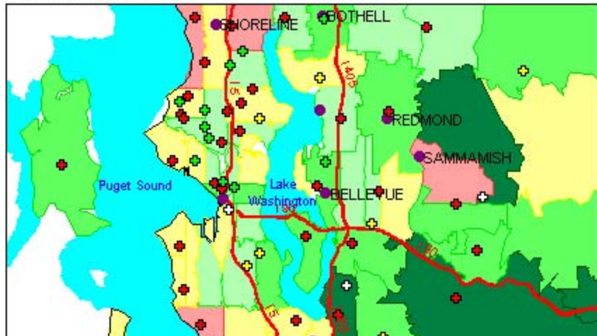
Seattle, WA Area

*Growing, stable or declining congregations were determined by (2007 \text{ avg att} - 2002 \text{ avg att}) / 2002 \text{ avg att} Growth: greater than .05 Declining: less than -.05 Stable: at or between .05 and -.05