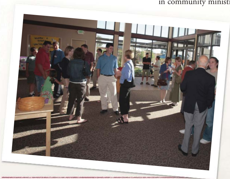
Members of Our Savior's Lutheran Church visit in the narthex after worship. Community ministry and worship attendance have grown since the congregation's new building was completed.